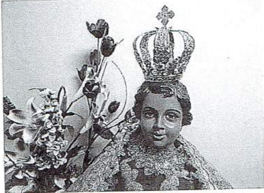
The Infant Jesus of Tamworth